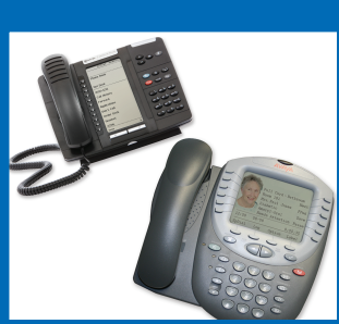
PATIENT WANDER AUDIO / VISUAL ALERTS