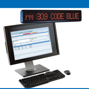
AUDIO / VISUAL ALERTS